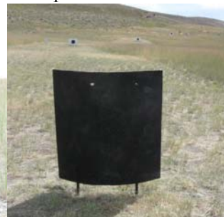
700Yd BPCR 48" Square