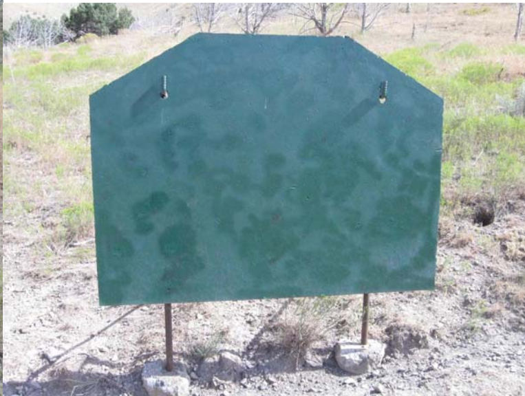
800 Yd ViMBAR 60" X 45"