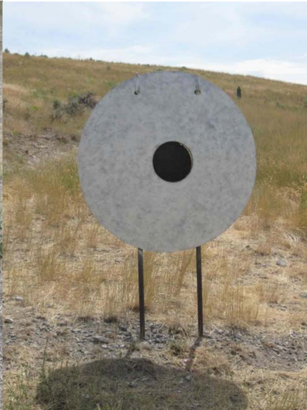
1,000Yd F-Class 48" Diameter w/10" Center