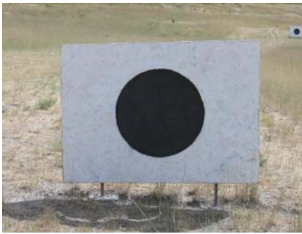
800Yd Creedmoore 4' X 6' w/32" Center