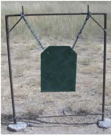
200-300-400Yd ViMBAR 20" X 24"