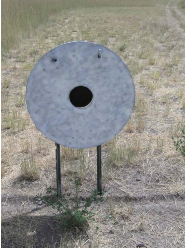
600-700-800Yd F-Class 30" Diameter w/6" center

Note that these are the only targets on the range that you can shoot at with magnum caliber rifles!