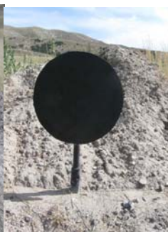
300Yd BPCR 18" Diameter