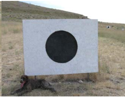
900Yd Creedmoore 5' X 7' w/36" Center