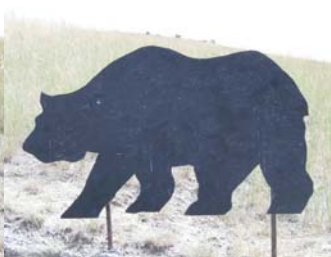
600Yd Griz BPCR 42" tall X 54" Long