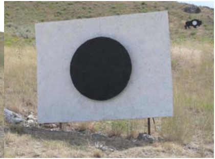
1,000Yd Creedmoore 6' X 8' w/42" Center