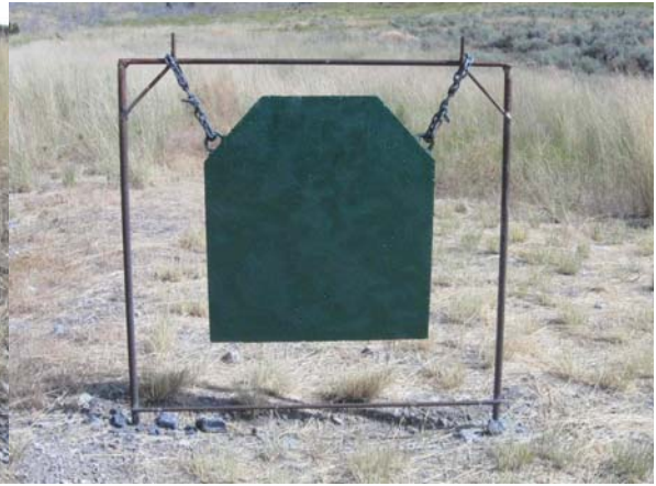
600 Yd ViMBAR 36" X 40"