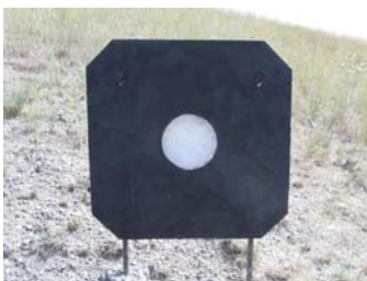
500Yd BPCR 38" Square w/10" swinging center