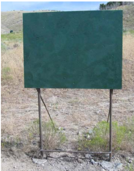
700Yd ViMBAR 36" X 48"