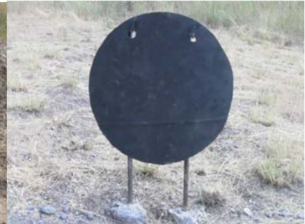
450Yd BPCR 30" Diameter