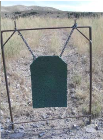
500 Yd ViMBAR 20" X 30 "