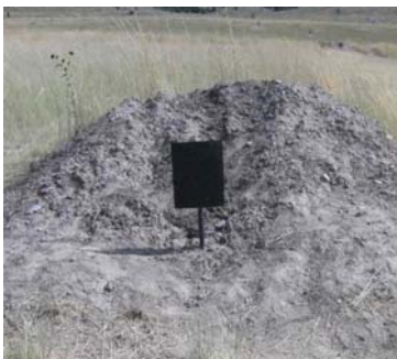
200Yd BPCR 12" X 16"

These targets are intended for Cast Bullets Only! Any rifle shooting cast bullets propelled by either smokeless or black powder are approved for these targets.