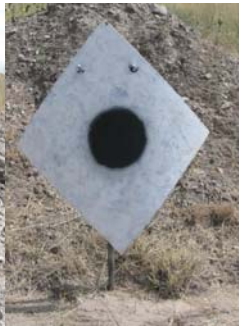
400Yd BPCR 30" across points